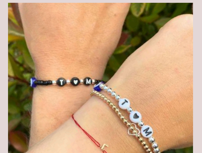
HIS AND HERS